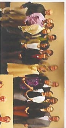
GSA Executive Board at 2014 Conference