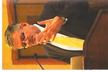
Professor Christopher Clark, University of Cambridge, at 2014 Conference