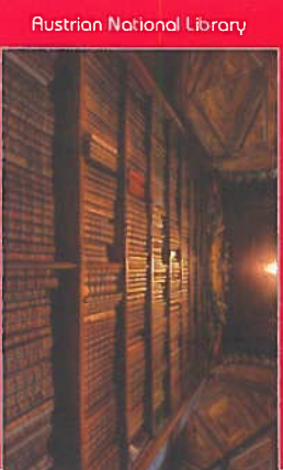
Austrian National Library

The German Studies Association is a member of the American Council of Learned Societies (ACLS) and is a 501 (c) 3 non-profit corporation.