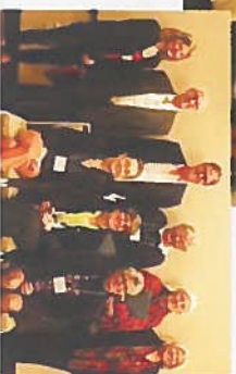
Gathering of GSA Presidents Past, Present, and Soon-to-Be at 2014 Conference

The GSA is led by a Board of Directors and the officers listed below. With the exception of the Executive Director, the Secretary-Treasurer, and the GSR Editor, all Board members are elected by the membership and serve fixed terms. The Association is governed through its By Laws that are approved and amended by its members.