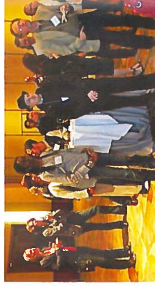
GSA Conference Participants at DAAD Reception in 2014