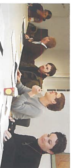
Berlin Program Students, Free University of Berlin

American Association of Teachers of German (AATG) American Council of Learned Societies (ACLS) Austrian Cultural Forum New York and Washington D.C. (ACFNW) American Institute for Contemporary German Studies (AICGS) Austrian Embassy Berghahn Books Central European History Society Deutsche Forschungsgemeinschaft (DFG) Documentation Archive of the Austrian Resistance (DÖW) Freie Universität Berlin/Berlin Program Friends of the Alexander von Humboldt Foundation Friends of the German Historical Institute (GHI) Friends of the German Literature Archives, Marbach German Academic Exchange Service (DAAD) German Embassy, Washington D.C. German Historical Institute (GHI), Washington D.C. Goethe Institut North America H-German International Association for the Study of German Politics (IASGP) Johns Hopkins University Press National Humanities Alliance (NHA) Swiss Embassy United States Holocaust Memorial Museum (USHMM) Women in German (WIG) Zentrum für Zeithistorische Forschung Potsdam And numerous universities, colleges, research centers, libraries, archives, and museums in North America, Europe, and elsewhere.